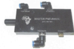
Guard Bar Interlock Valve