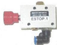
Emergency Stop Valve 1