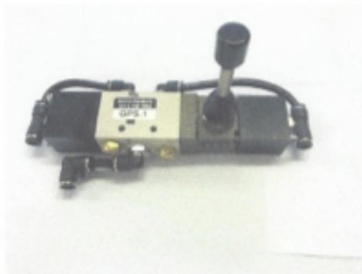
Gravity / Pump Switch