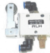
Heavy Duty Roller Lever Valve