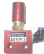
Emergency Stop Valve 2